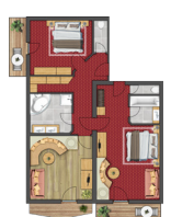
FAMILY SUITE "SIMILAUN" | approx. 96m 2 for 4 to 8 people

"Similaun" suite and "Talleit" junior suite with two bedrooms, one of them with walk-in wardrobe, the other with living area with pull-out couch, seating corner with tiled stove and bathroom with bath and starry sky. Cosy living room with corner seating and tiled stove, pull-out couch, desk. Second bathroom with infrared shower, double basin and separate WC, Wi-Fi, telephone, radio, satellite TV, room safe, balcony.