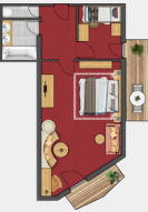
JUNIOR SUITE PLUS "RAMOLKOGEL" | approx. 51m 2

Suite in matured wood with separate single room or room with bunk bed, cosy living area with desk, pull-out couch and corner seating with tiled stove, bathroom with bath, double basin and separate WC, Wi-Fi, telephone, radio, satellite TV, room safe, balcony.