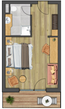
LUXURY ROOM "SPIEGELKOGEL" | approx. 31m 2

Spacious double room in Alpine style with wooden floors, cosy couch, bathroom with shower and WC, Wi-Fi, telephone, radio, satellite TV, room safe, balcony.